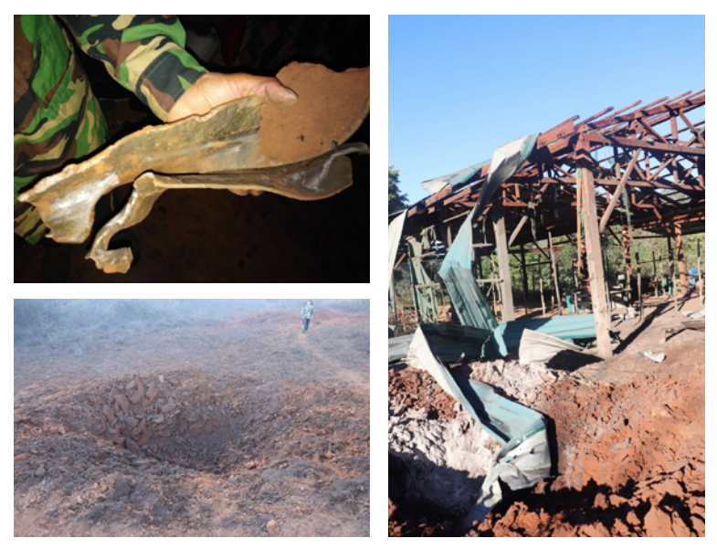
[TOP LEFT] A Karenni soldier shows remnants of a bomb found near a makeshift IDP camp near Ree Khee Bu village in Karenni State's Hpruso Township following a Myanmar Air Force airstrike on the camp that killed three people on January 17, 2022. © PL, January 2022.

[RIGHT] The destroyed remains of the makeshift IDP camp near Ree Khee Bu in Hpruso Township following a Myanmar Air Force airstrike on the camp on January 17, 2022. © PL, January 2022.