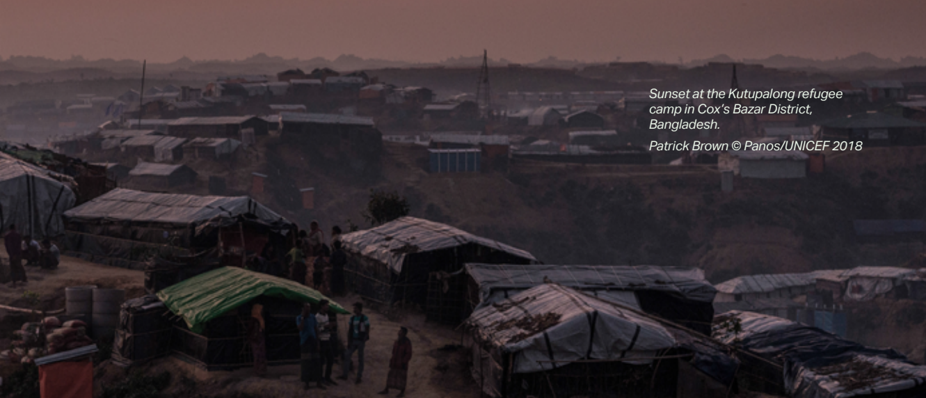
Sunset at the Kutupalong refugee camp in Cox's Bazar District, Bangladesh.